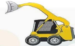
Skid Steer Loader