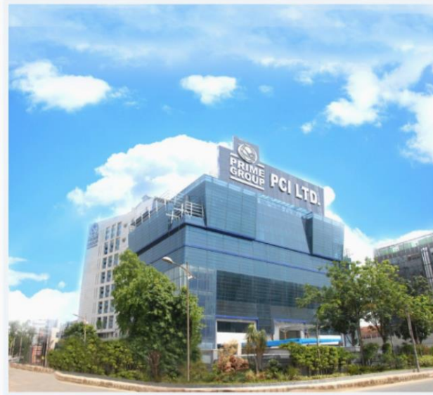
Prime Group Headquarters

Platinum Rated LEED Certified Green Building