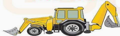
Front and Backhoe Loader

Download the 100 Diggers & Excavators App at